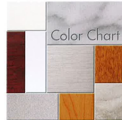
c o l o r • c h a r t for interior applications